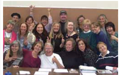
Students from It's Your Business Celebrating Graduation!

The new JEDI membership model is designed to emphasize mutual investment and success. It allows you to support your community to prosper and grow your local businesses. It provides you with deep discounts and great benefits. Those who might consider membership include business owners, entrepreneurs and self-employed persons, anyone developing a business idea, elected officials, community agencies, community members, funders and partner organizations.